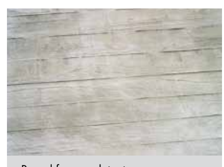
Board formwork texture reproduced in repaired areas