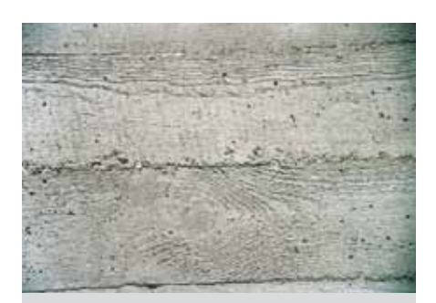
Mineral stain finish (without filler), pores and cavities remain open