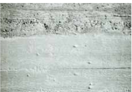
Grout applied by brush, coarse board formwork texture maintained