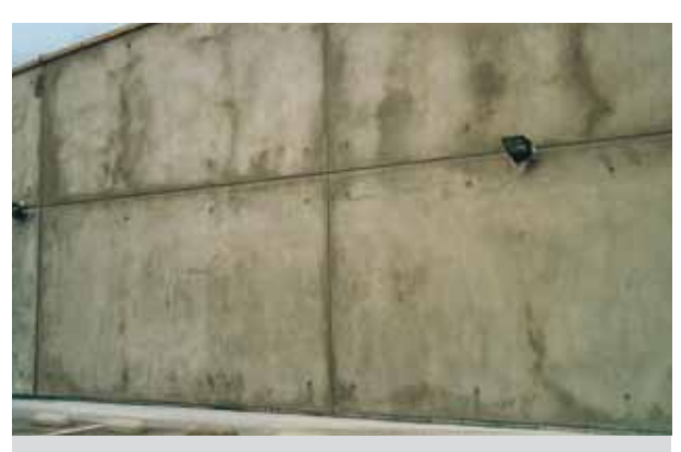
New concrete with severe blemishes