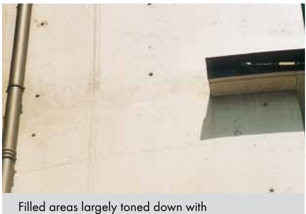
Filled areas largely toned down with KEIM Concretal-Lasur