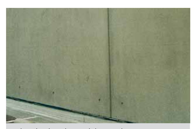
Blemishes largely toned down with KEIM Concretal-Lasur