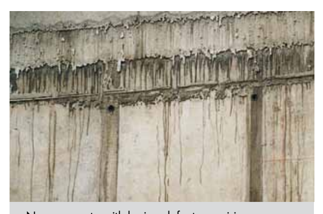
New concrete with laying defects requiring subsequent filling