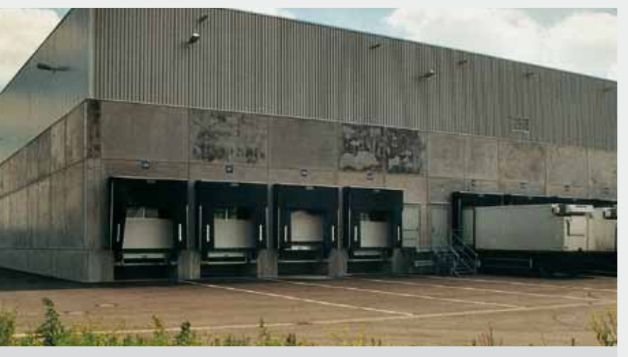
Uneven, unattractive appearance

To create a uniform appearance by carefully aligning the blemished areas to the original concrete colour.