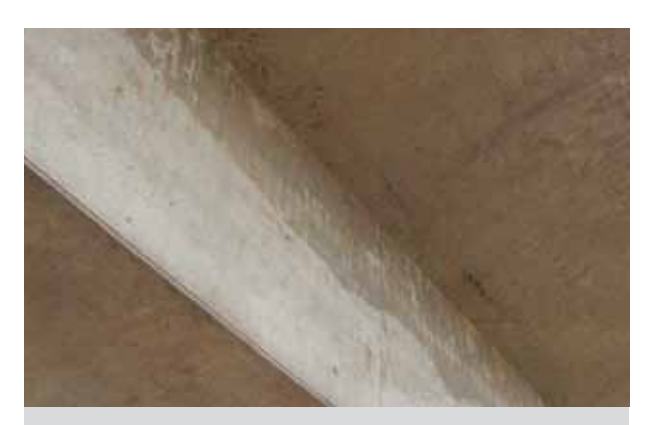
New concrete with slight blemishes