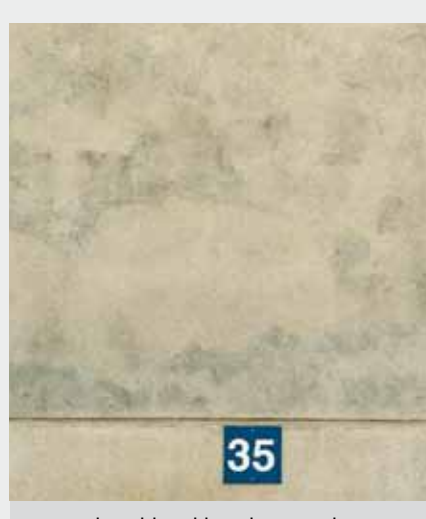
Equalized by diluted mineral stain finish