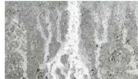
New concrete with severe blemishes