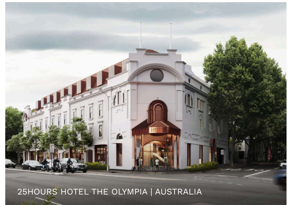
25HOURS HOTEL THE OLYMPIA | AUSTRALIA

KEIM Concretal-Lasur also offers the freedom to customise both colour intensity and opacity—perfect for creating layered, natural finishes that highlight the texture of concrete or stone. The result: a refined, enduring aesthetic that enhances without masking.