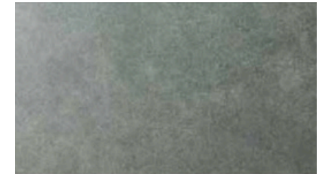
Blemishes either strongly equalised or complete colour-matched mineral finish