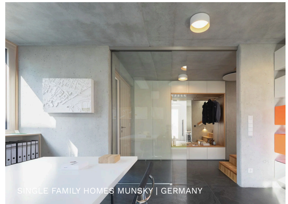
SINGLE FAMILY HOMES MUNSKY | GERMANY

With full control over colour and opacity, it enhances the raw beauty of concrete and other porous surfaces—revealing texture, adding atmosphere, and delivering a soft, mineral-rich translucency that elevates contemporary interiors.