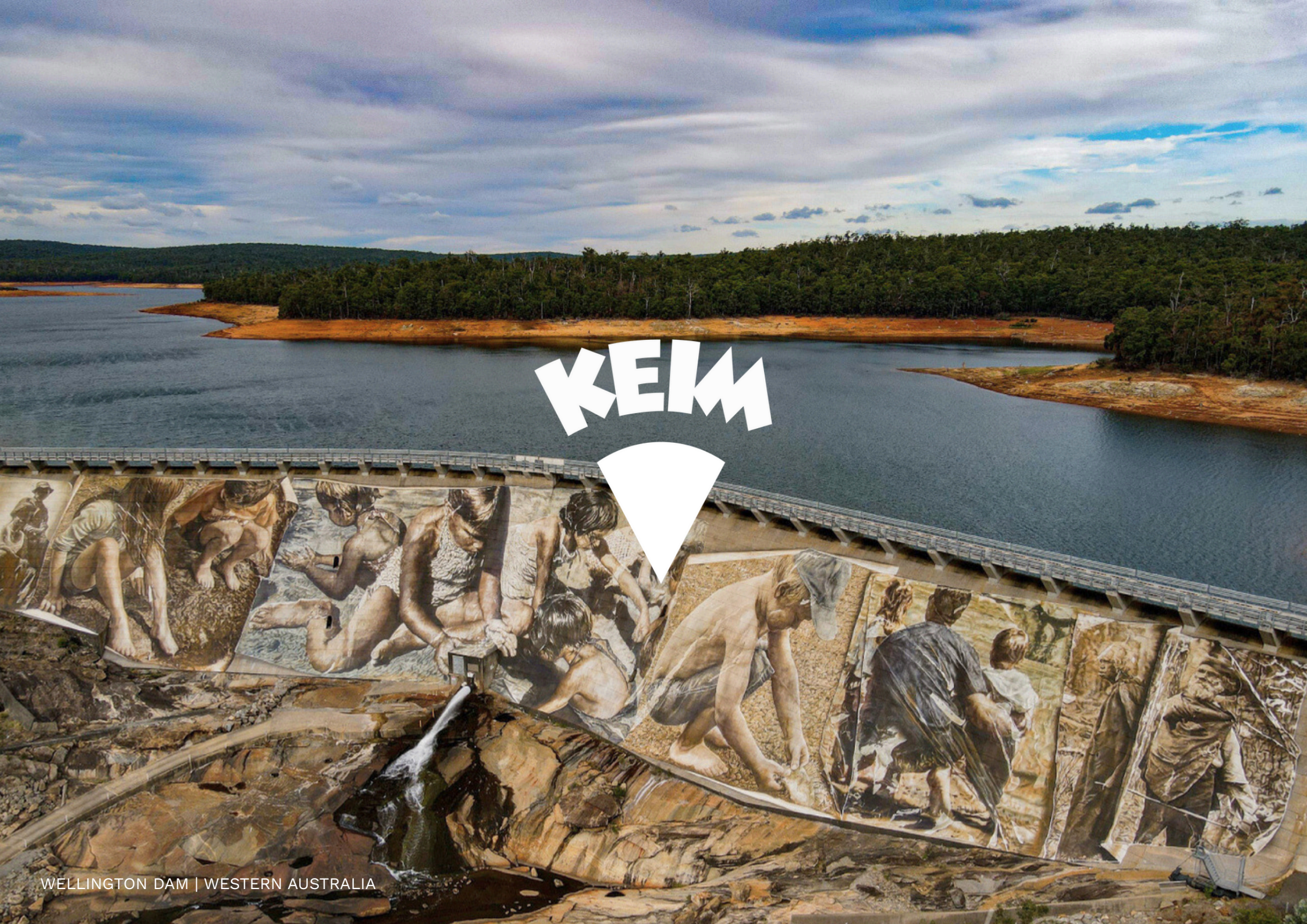
WELLINGTON DAM | WESTERN AUSTRALIA