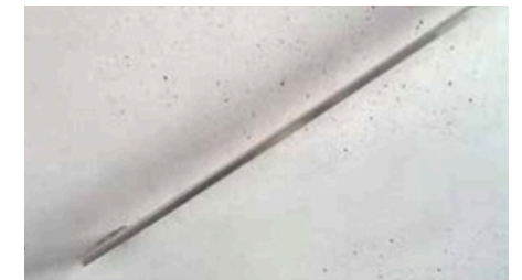
Refilled areas either strongly equalised or complete colour-matched mineral finish