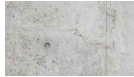
New concrete with slight blemishes