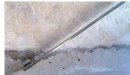
New concrete with defects that need to be refilled